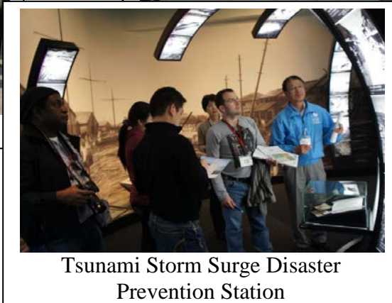
Tsunami Storm Surge Disaster Prevention Station