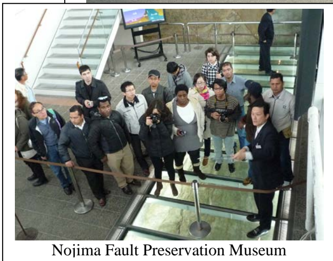
Nojima Fault Preservation Museum