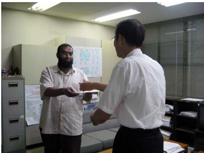
Presentation of certificate