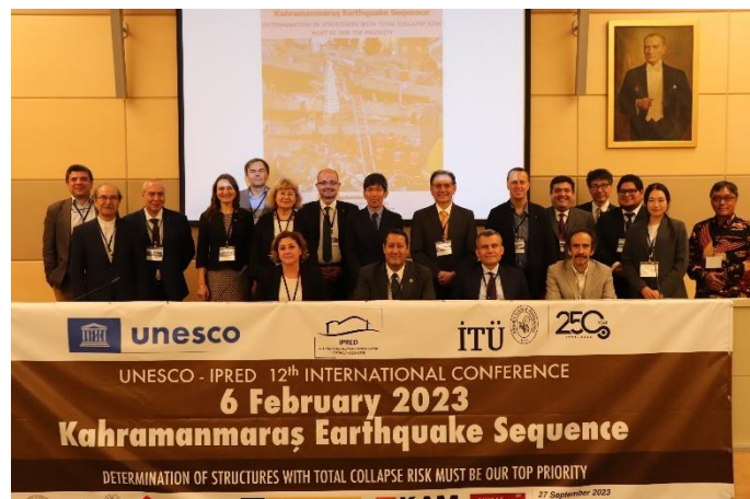
Photo Participants in the IPRED Annual Meeting

Research Engineer, International Institute of Seismology and Earthquake Engineering, Building Research Institute