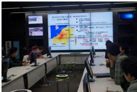
Nagaoka city Crisis Management and Disaster prevention headquarters