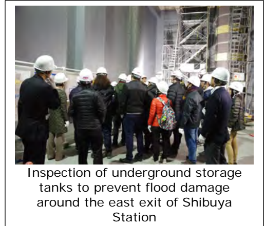
Inspection of underground storage tanks to prevent flood damage around the east exit of Shibuya Station