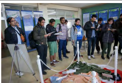
former Arahama Elementary School (Tsunami Damaged Area)