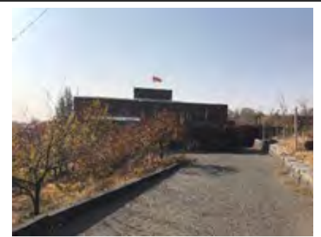
External Appearance of the NSSP in Yerevan