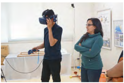
Virtual earth experience at Tohoku University