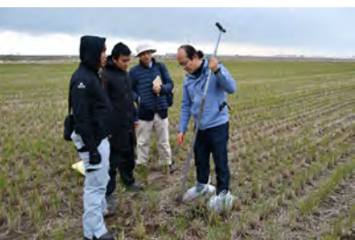
Observation of Tsunami deposit in Sendai Plain Area