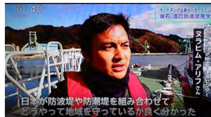
TV Interview at breakwater in the mouth of Kamakshi bay