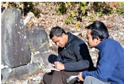
Stone monument in Settai Taro, Miyako