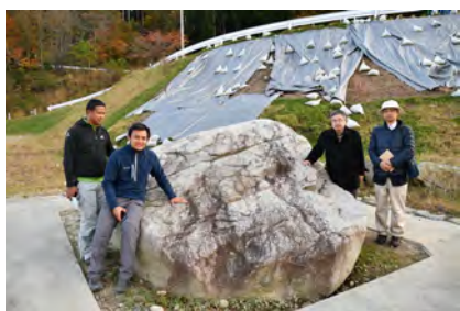
Tsunami Stone in Yoshihama, Ohunato