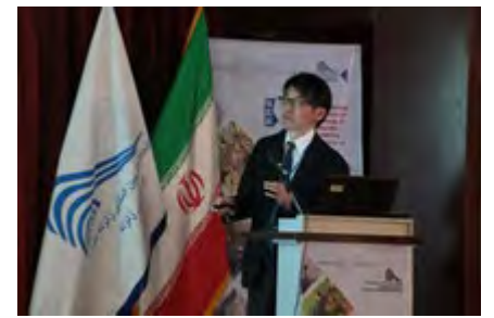
Presentation at the SEE8 in Tehran

After the SEE8, I went to Yerevan, the capital city of Armenia. I visited the Earthquake Engineering Center of National Survey for Seismic Protection (NSSP) and introduced the training program of the IISEE. Also, I exchanged recent information on earthquake engineering and discussed it with Armenian researches of the NSSP. I think that we could build a dense human network between the NSSP and the IISEE due to this visit.