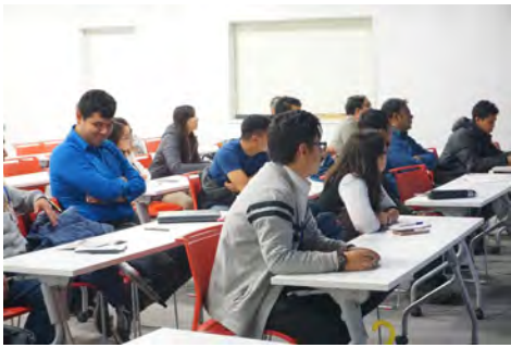
Nagaoka Earthquake Disaster Archive Center