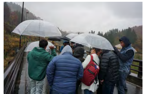
Kogomo Memorial Park