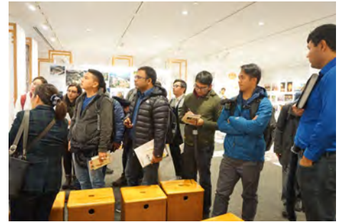
Yamakoshi Revitalization Center Orataru