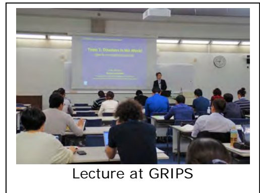
Lecture at GRIPS

We hope all participants enjoy this cold winter with joining the Year-end party held by IISEE and coming into contact with Japanese New Year custom.