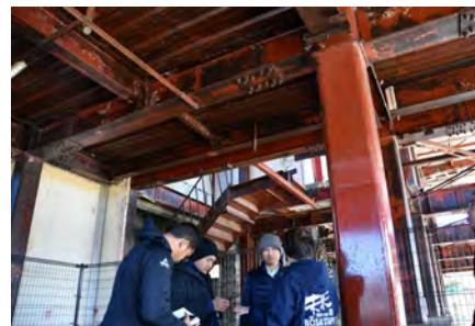
Former Tarou Tourist Hotel in Miyako