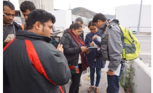
Earthquake Disaster Oral Tradition Disaster Prevention Program, Disaster Prevention Machiaruki Mirai Support Ishimaki