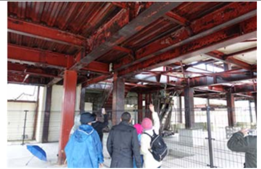
Tarou Tourist Hotel in Miyako