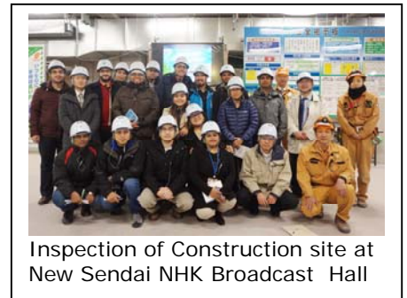
Inspection of Construction site at New Sendai NHK Broadcast Hall

We appreciate the support in site by the people in associated institutions and organizations. (Please see P2 for the snapshots of the study trip.)