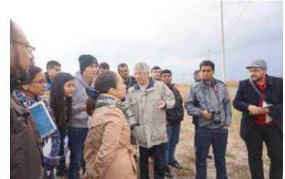
former Arahama Elementry School in Sendai