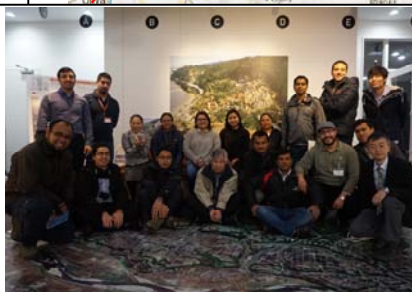
Nagaoka Earthquake Archive Center Kioku Mirai