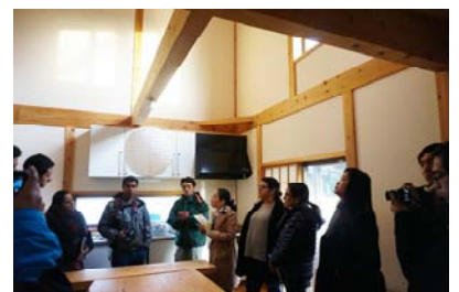
Restoration Housing Takesawa