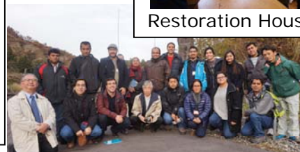
Reconstruction Museum Satomian