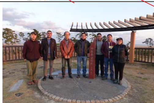
Millennium Hope Hills, Iwanuma city