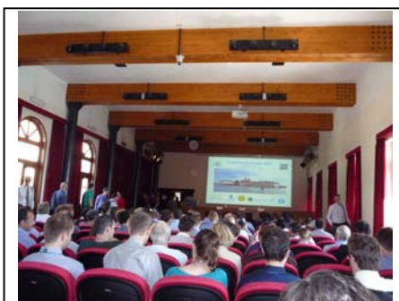
Photo 1: Opening Ceremony in the Auditorium, the Conference Center, San Servolo Island