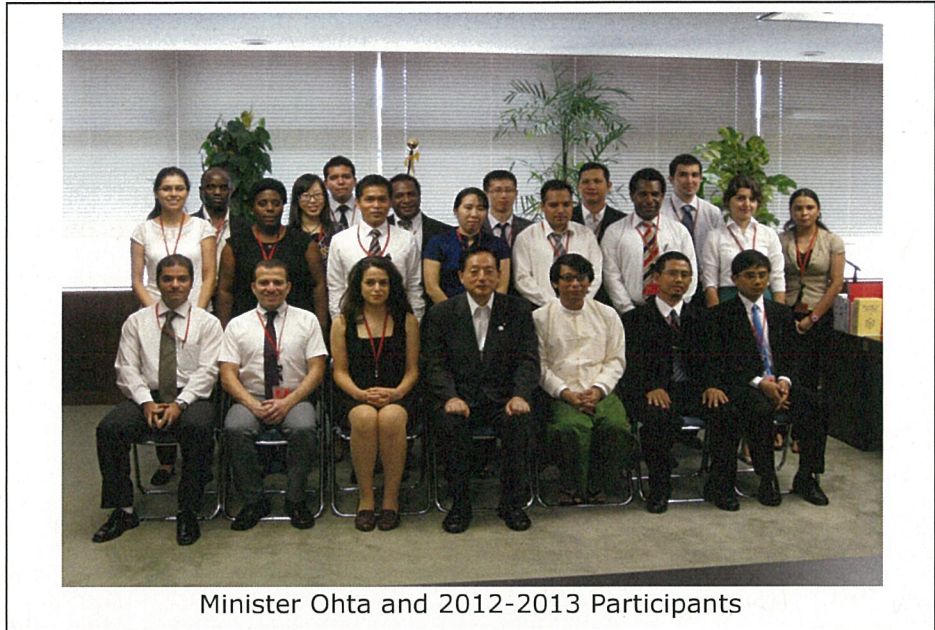
Minister Ohta and 2012-2013 Participants

On September 3, 2012-2013 training participants paid a courtesy visit to Mr. Akihiro Ohta, Minister of Land, Infrastructure, Transport and Tourism.